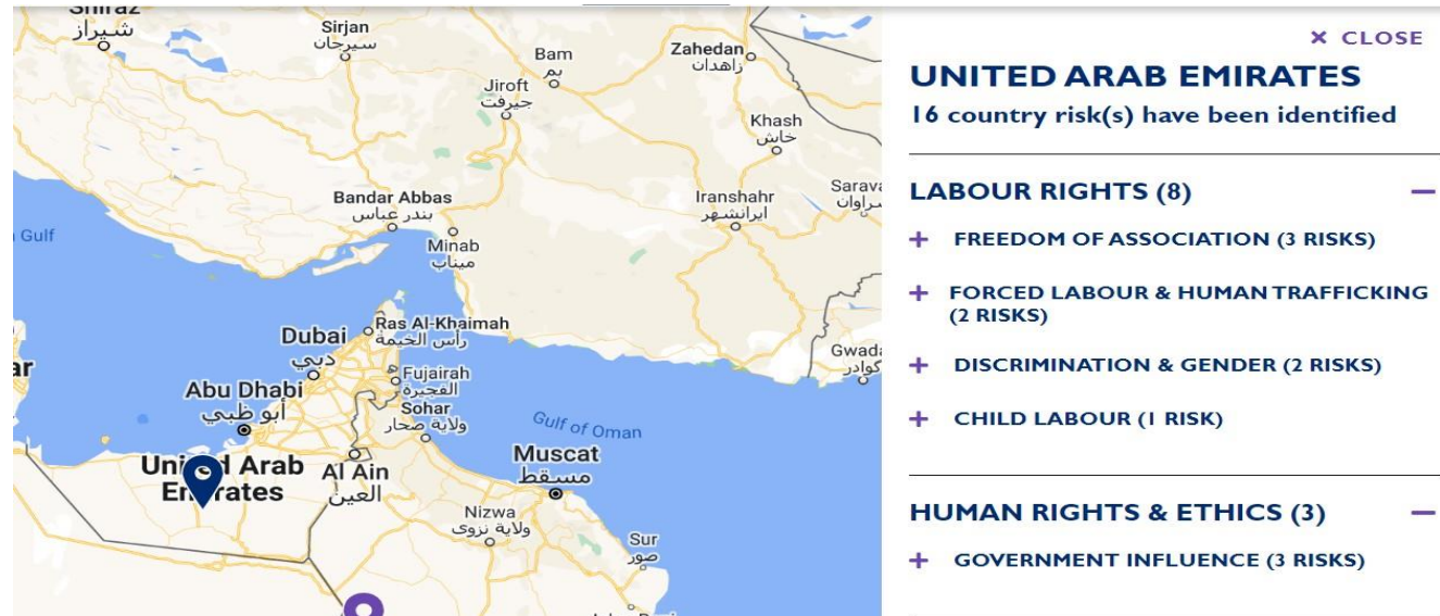
Figure 1 - Key risks for UAE as of Apr 2023