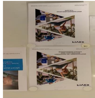
Figure 6: Policies on noticeboard in FZ