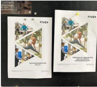
Figure 5: Policies on noticeboard in FJV

The policies are pasted on the notice board at the properties for ease of access and availability to all employees.