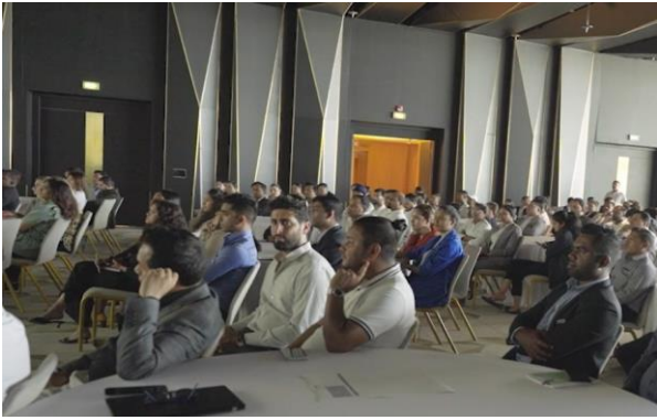
Figure 3: Attendees at the townhall in FPJ